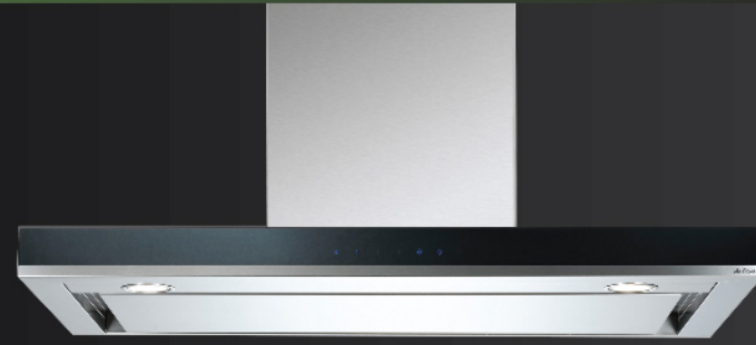
Horizonte 900 (V2) | Horizonte 1200 (V2)