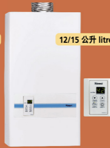
RSW120TFL $6,480 RSW150TFL $6,980