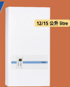
RSW120RFL $6,480 RSW150RFL $6,980