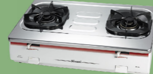
雙頭爐 RRJH2 $3,180 Double-burner Hotplate

最強火力 6.0 千瓦 日本製 Extra Powerful Flame 6.0 kW Made in Japan