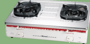
火霸王 R22 $3,180 Hot Shot