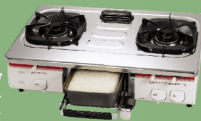
煮飯寶 R3HR $3,380 Superbowl

全港獨有特快煮飯寶 Exclusive Feature Express Rice - cooker 煮15碗飯只需20分鐘 Cook 15 bowls of rice in only 20 minutes