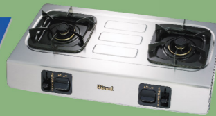
雙頭爐 RRJH21 $2,580 Double-burner Hotplate