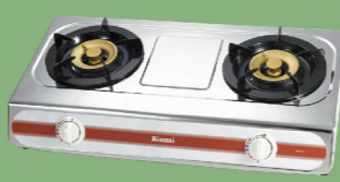
雙頭爐 RRS2 $1,680 Double-burner Hotplate