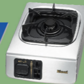
單頭爐 R1N $1,580 Single-burner Hotplate