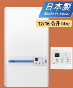
RJW120RFL $8,380 RJW160RFL $9,080