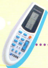
Remote control 遙控器